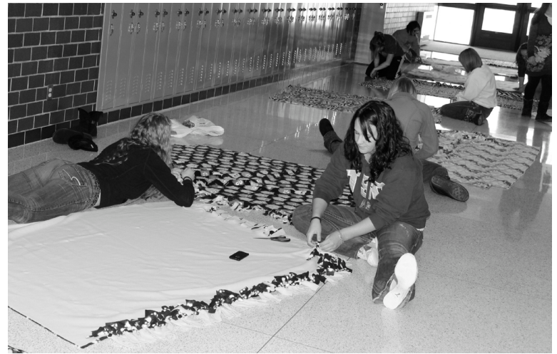
Above: Students in independent living work on their tie blankets.

Next, the independent living students will be covering how to shop for groceries on a budget and will be doing a cooking unit.